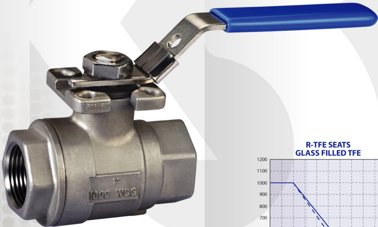
R-TFE SEATS GLASS FILLED TFE